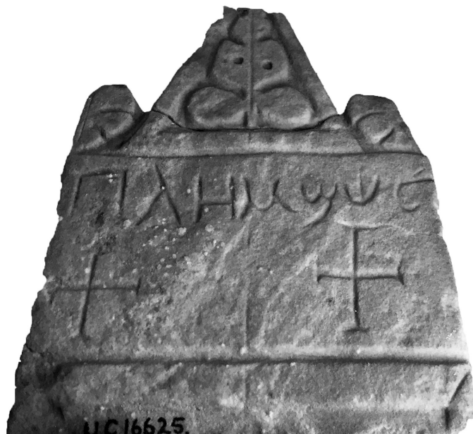
Figure 3. Petrie Museum of Egyptian Archaeology, inv. UC 16625.