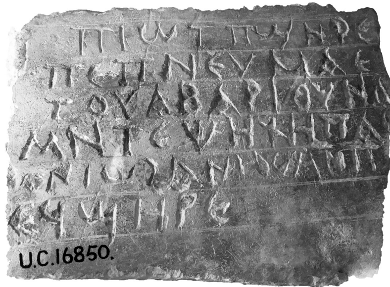
Figure 2. Petrie Museum of Egyptian Archaeology, inv. UC 16850.